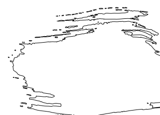
TITANIUM WHITE PW6 | LIGHTFASTNESS: I