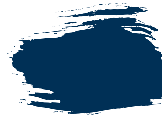
PHTHALO BLUE PB15:3 | LIGHTFASTNESS: I