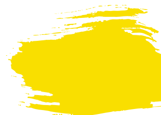
HANSA YELLOW LIGHT PY3 | LIGHTFASTNESS: II