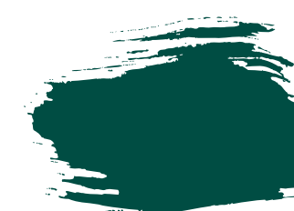
PHTHALO GREEN PG7 | LIGHTFASTNESS: I