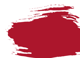
QUINACRIDONE RED PV19 | LIGHTFASTNESS: I