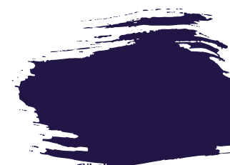
DIOXAZINE VIOLET PV23 | LIGHTFASTNESS: II