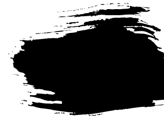
SUPERGRAPHIC BLACK PBK7 | LIGHTFASTNESS: I