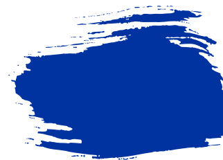
ULTRAMARINE BLUE PB29 | LIGHTFASTNESS: I