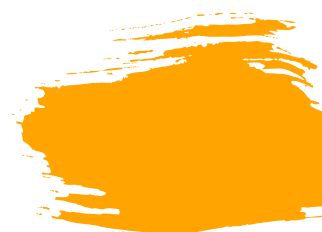
DIARYLIDE YELLOW PY65 | LIGHTFASTNESS: I